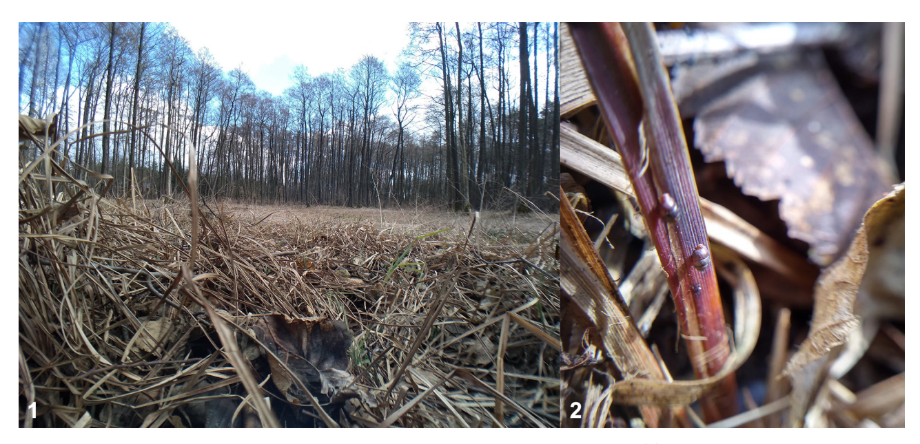
Figs 1–2. Site of Vertigo antivertigo from which the experimental snails were collected (1), and individual snails on a sedge leaf blade at the same site (2)

tures on the day preceding the collection were 15 °C during the day and -3 °C during the night. On the day of collection the temperature raised to 21 °C (source: https://www.accuweather.com/). The snails were collected from leaf blades (live or dead) of Carex acutiformis. On the same day each individual was placed in a separate 120 ml tube with food (leaf litter from the locality), a source of calcium (dolomite dust) and water-saturated cotton-wool substrate for two-day acclimation prior to the experiment. The tubes with animals were stored in a humidified transparent plastic container (relative humidity RH ca. 100%) at room temperature (24 °C) and natural photoperiod. During the acclimation period the tubes were sprinkled with water once a day (6 p.m.) to stimulate the activity. Only adult snails with fully developed shell (with apertural armature; 4.0–5.0 whorls; POKRYSZKO 1990) were used.